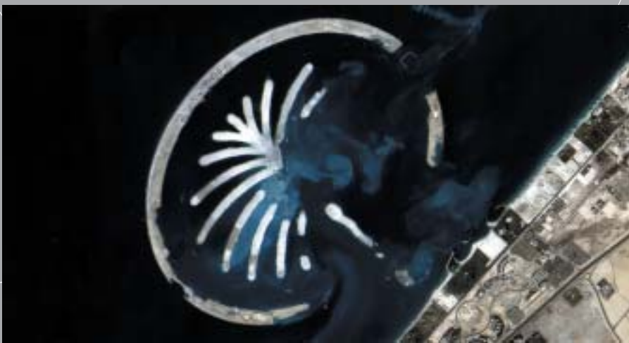
Clockwise from above: Palm Island Development, Dubai; Ennore Port Development, India; Norfolk beach nourishment UK.