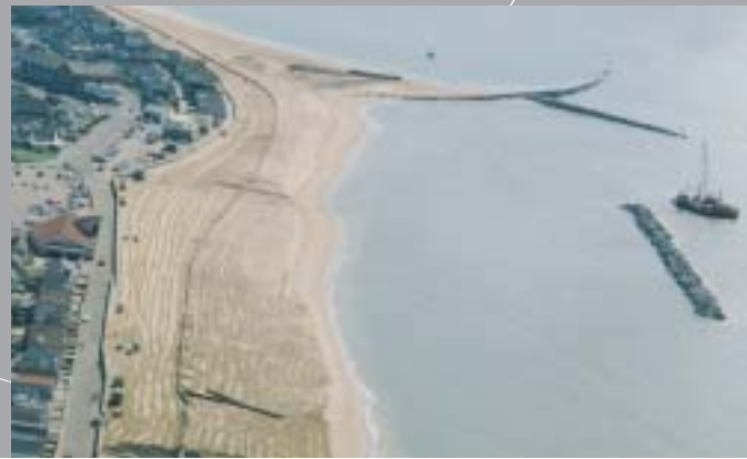
Flushing Port, The Netherlands; Tripoli Breakwater redesign, Libya; Clacton Breakwater, UK. Main image front cover: Hidd Port Development, Bahrain