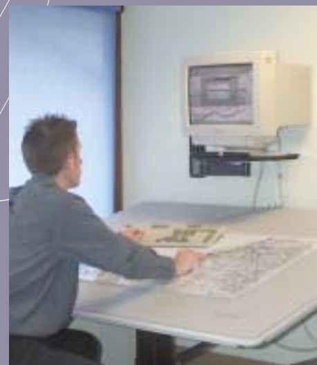
Clockwise from top: Moray Flood Alleviation Group Website, GIST In-house Developed GIS Viewer, Offshore GIS (The Crown Estate), GIS Data Capture, Container Terminal Simulation, Loch Laxford biotope mapping (Scottish Natural Heritage), Urban Capacity Study Database (Rugby Borough Council), Coastal defence monitoring for local authorities.