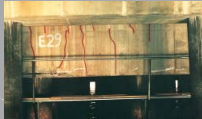
Clockwise from top left: Refurbishment of bulk handling jetty, Guinea, West Africa; Accident repairs, Malaysia; Detailed inspection of cracked concrete jetty beams; Inspection of cracking to corrosion damaged concrete jetty deck.