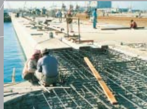
Clockwise from top left: Ground anchoring to stabilise quay, UK; Installing limpet dam to inspect and repair steel sheet piles below water level; Modification and repair of quay capping beam, Middle East; Replacement pile head ready for jacking into place; Accidental structural damage to concrete pile head, Malaysia.