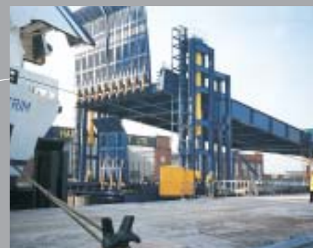
Clockwise from above: Kamsar, Guinea; ??; Swelly Rock Navigational Aid, Uk.; Belfast Ro Ro, Ireland; Navigational aid?.