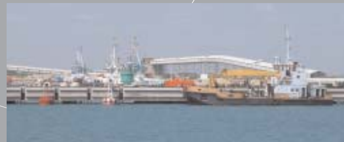
Clockwise from above: Sheerness Lighting Scheme and Ship Access and Walkway, UK; Marad Study; Posport simulation package; Prestige1.jpg