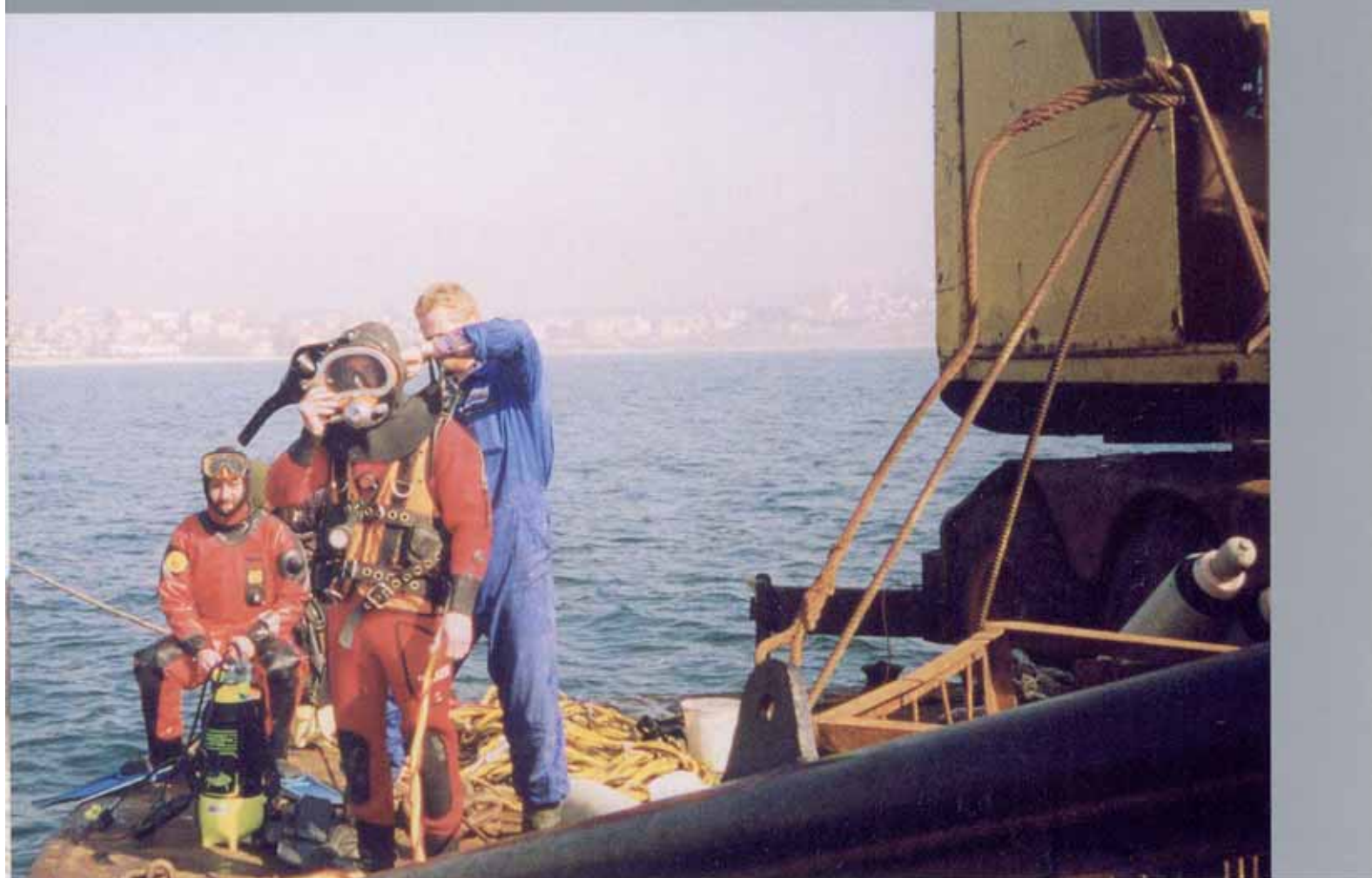
Marmara Power Plant, Turkey.