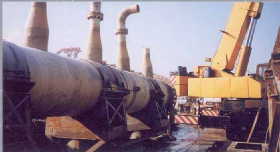
Clockwise from above: Broughty Ferry, Dundee RNLI Station; St. Katherine Dock, London; Marmara Power Plant, Turkey; Jetty inspection, Erith.