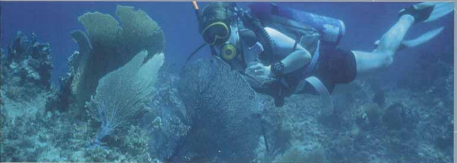
Clockwise from above: Axmouth Harbour, Devon; Felixstowe oil jetty; environmental survey in Grand Turk.