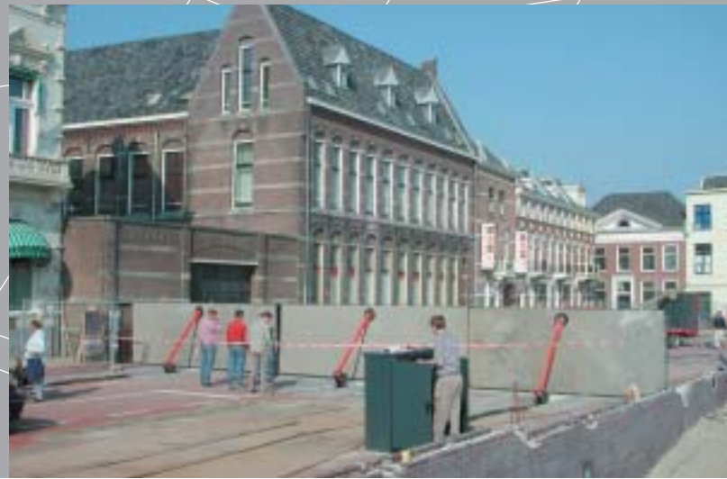
Clockwise from top left: Lower Tone Flood Alleviation Scheme, Somerset, UK; Page from Elgin Flood Event Report in partnership with Moray Council; Kampden demountable defences, The Netherlands; Asset Management Survey, Sussex, UK.