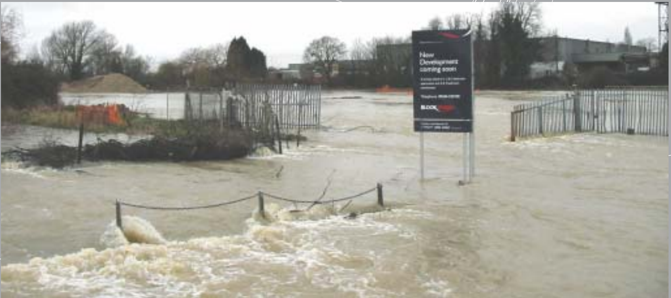
Clockwise from top left: Hambleton, Hampshire UK; Pumping operation, Patixbourne, Kent, UK; Little Paxton, River Great Ouse, UK.