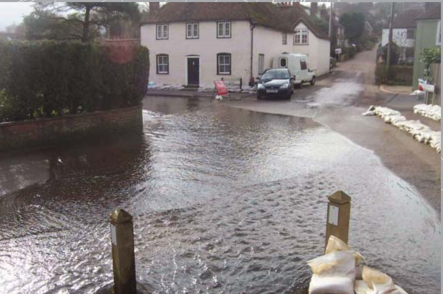
Above: Nailbourne, Kent UK.