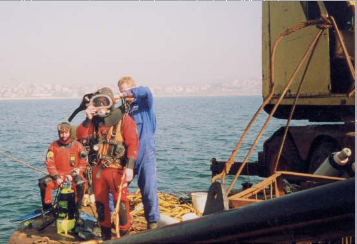
Marmara Power Plant, Turkey.