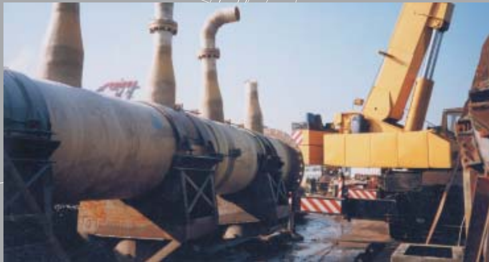
Clockwise from above: Broughty Ferry, Dundee RNLI Station, UK; St. Katherine Dock, London, UK; Marmara Power Plant, Turkey; Jetty inspection, Erith, UK.