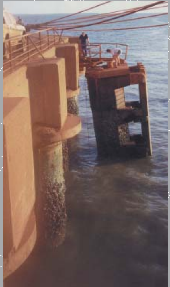
Clockwise from above: RM Turnchapel, Devon, UK; Port of Kamsar, Republic of Guinea; RM Turnchapel, Devon, UK.