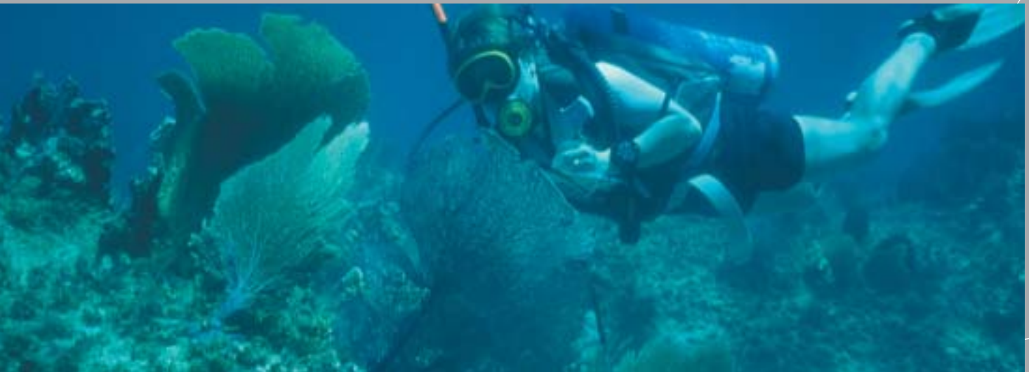
Clockwise from above: Axmouth Harbour, Devon, UK; Felixstowe Oil Jetty, UK; Environmental Survey, Grand Turk.