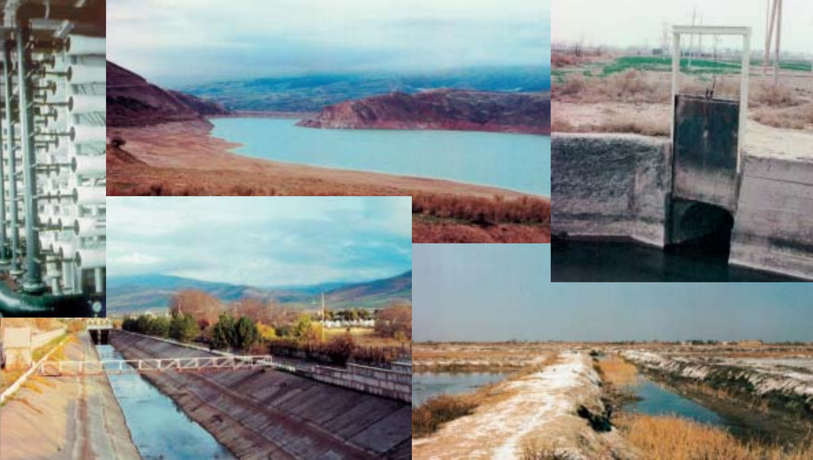
Soil salinisation is a major problem in the Aral Sea Basin in Central Asia due to massive irrigation works. A legacy of lack of coordinated planning and cooperation.

> Egypt >> Hungary >> India >> Indonesia >> Kyrgystan >> Mali >> Moldavia >> Morocco >> Nigeria >> Pakistan >> Philippines >