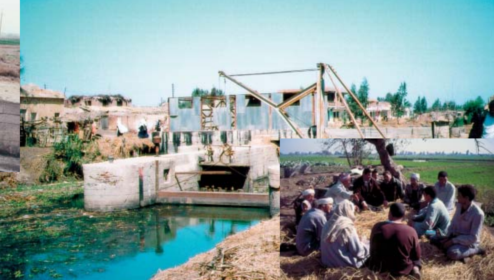
Water Board employees present and discuss plans for the expansion of irrigation works and the recovery of the costs.

“The results within the ten pilot Water Boards have been instrumental to the development of appropriate legislation and a new policy of participatory water management in Egypt.”