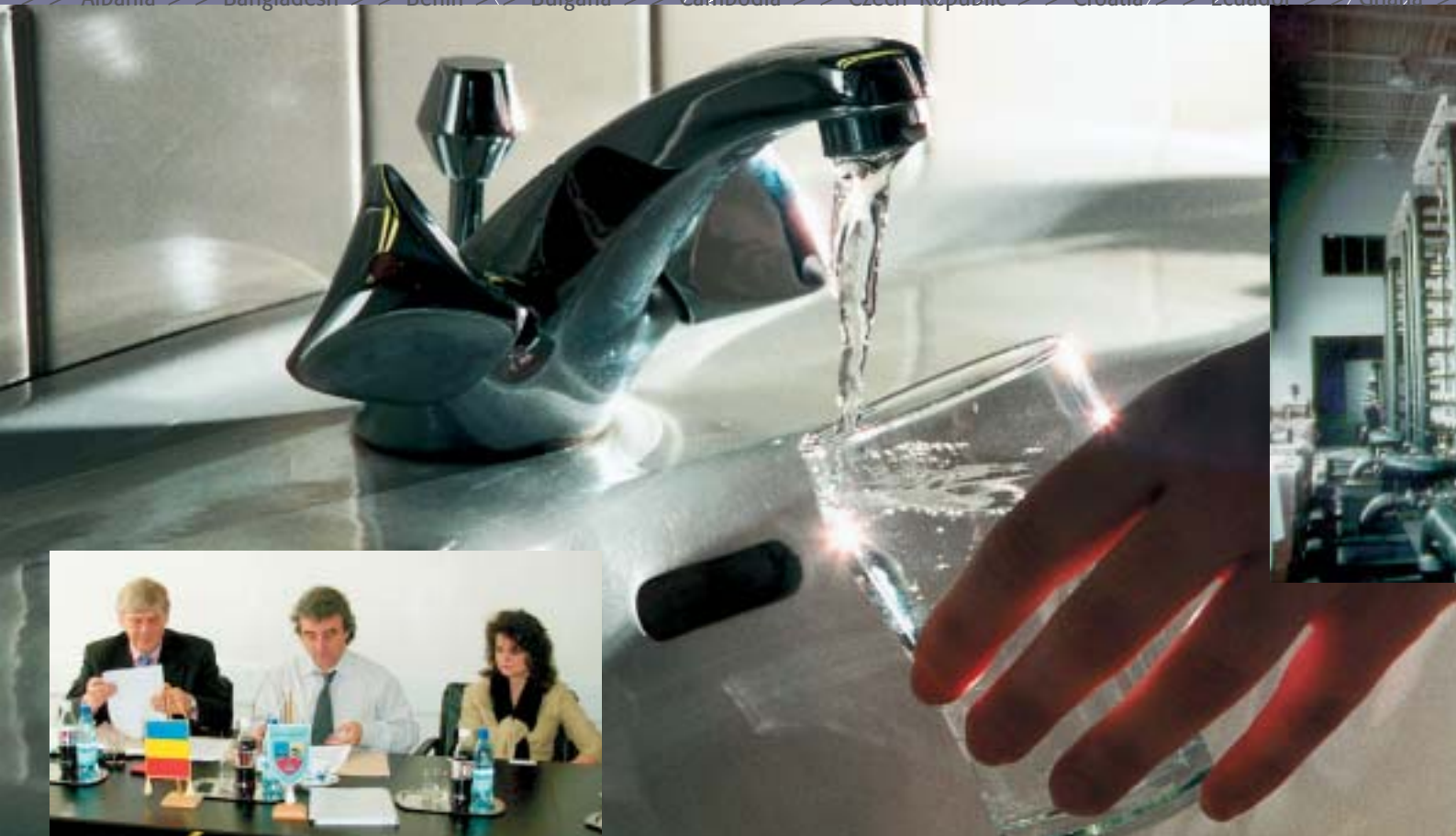
Information sessions organised by the City of Constanta help in maintaining a high degree of transparency of the transaction process.

>> Albania >> Bangladesh >> Benin >> Bulgaria >> Cambodia >> Czech Republic >> Croatia >> Ecuador >> Ghana >>